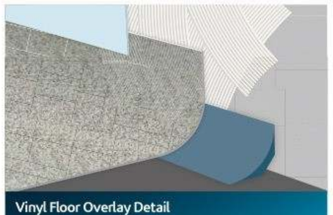
Vinyl Floor Overlay Detail