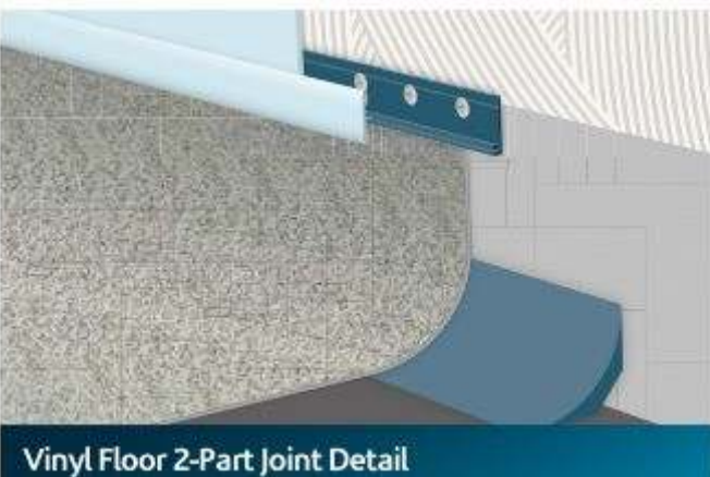
Vinyl Floor 2-Part Joint Detail