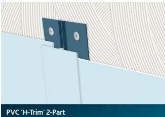
PVC 'H-Trim' 2-Part

We are committed to providing exceptional workmanship and are teams are renowned for their quality of work. To ensure a quality installation, below are the different joining methods which can be used for all PVC hygienic cladding regardless of the brand.